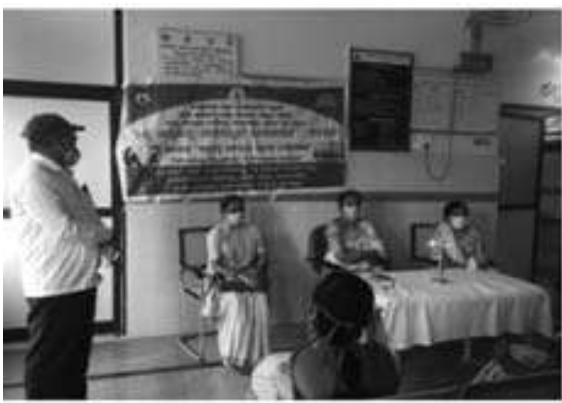
International Women's Day 2021