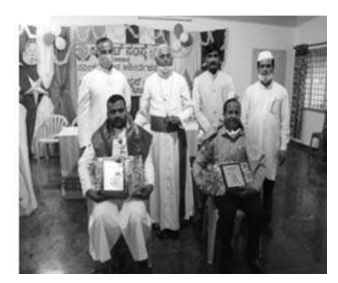
Felicitation of Previous Directors