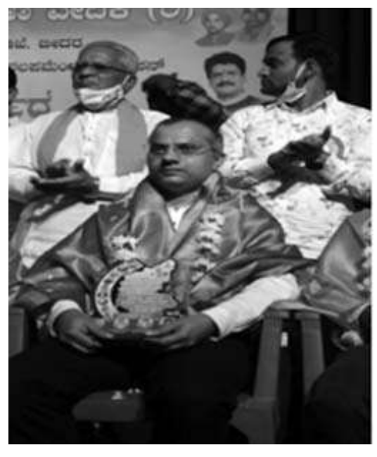
felicitation of Director awarded for outstanding contributions in COVID Relief work